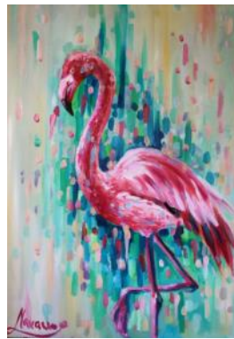
August 18th Flamingo

Join us for a relaxing fun night out. Bring your bottle of wine and a group of friends as you create your own artwork. $35 covers instructions & supplies. Fridays 7-9pm