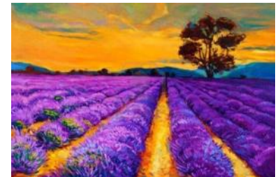
September 15th Lavender Fields