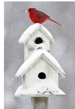
November 17th Snow Bird House