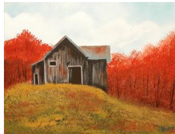
October 20th Fall Barn